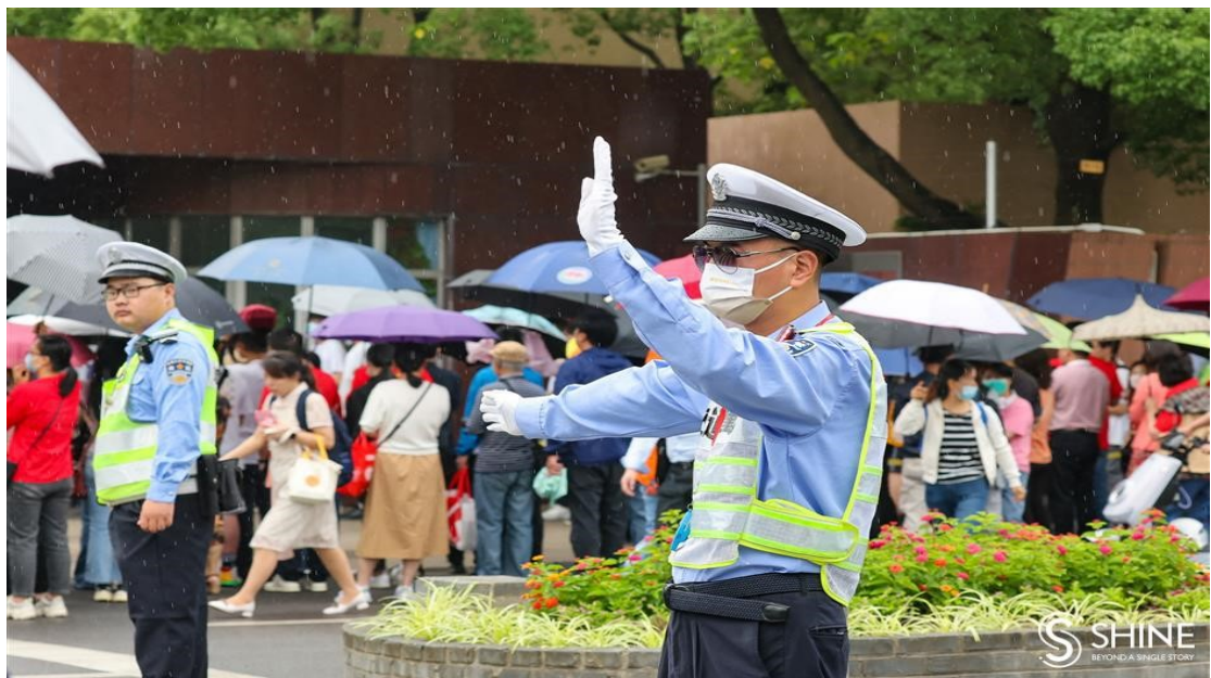
Traffic police are in place to ensure traffic runs smoothly and students are safe.