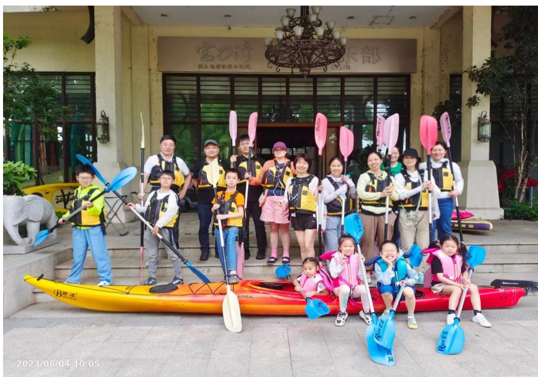
HOPE Shanghai staff and kids celebrating International Children's Day with a kayak excursion on 4 th June