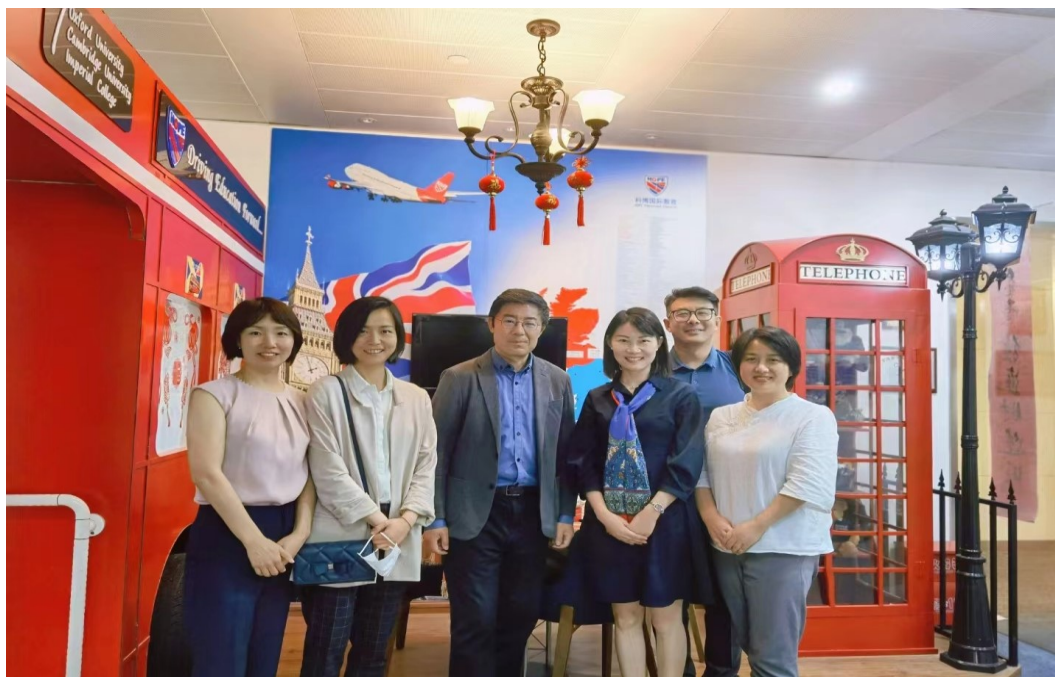
Newcastle University visited HOPE Shanghai on 2 nd June