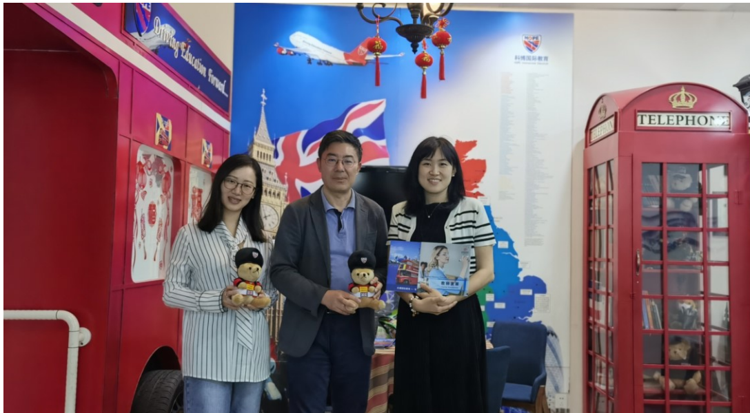
The British Council visit HOPE to discuss IELTS and APTIS promotion on 7 th June