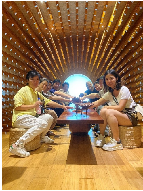
Modern "Zen-style" living room