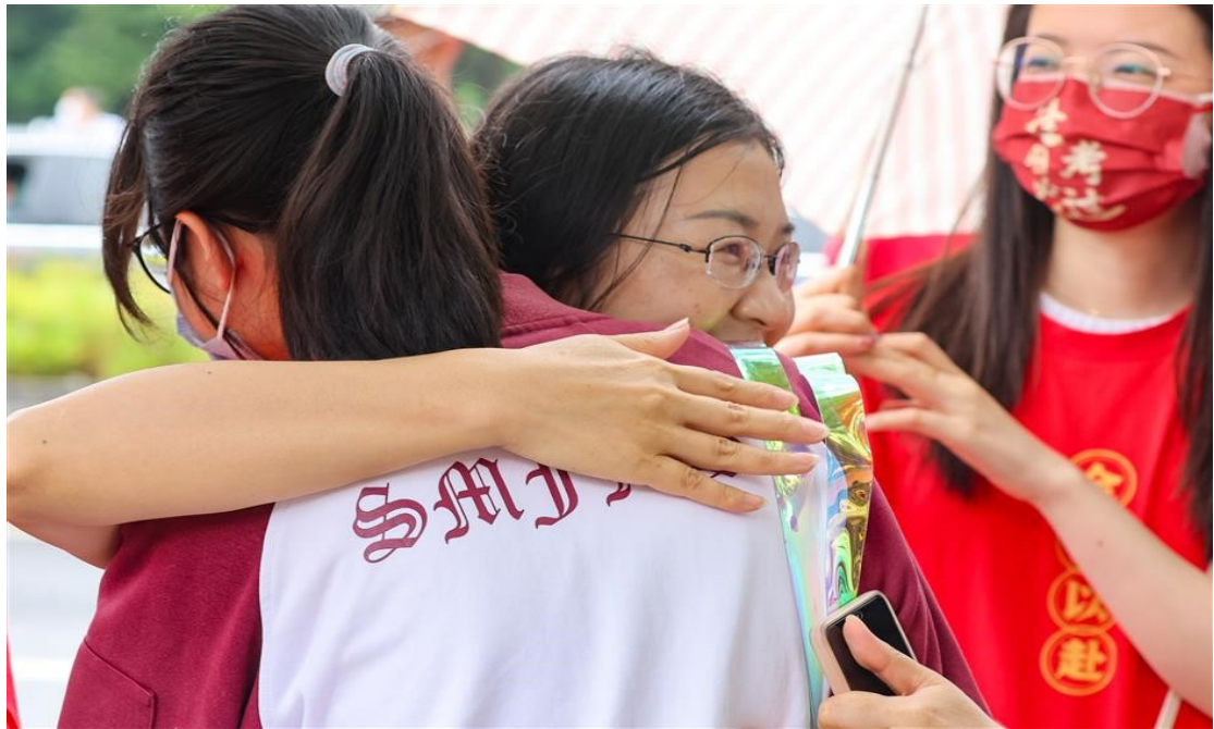
Students hug each other before the exams begin.