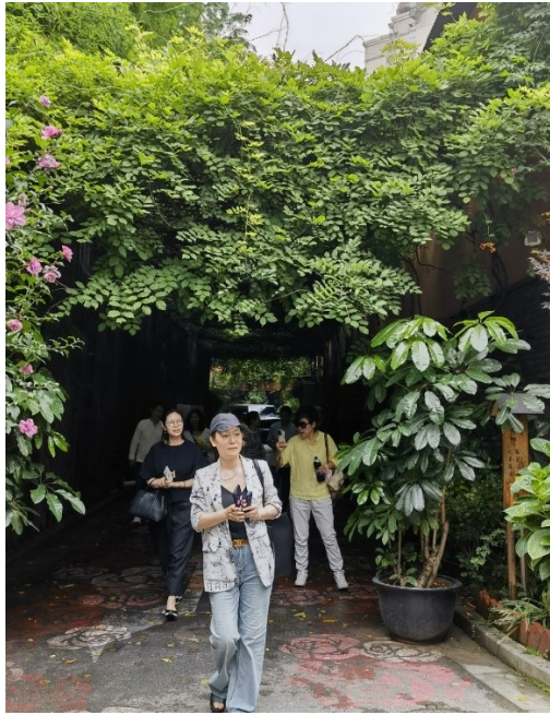
A lovely stroll at idyllic garden