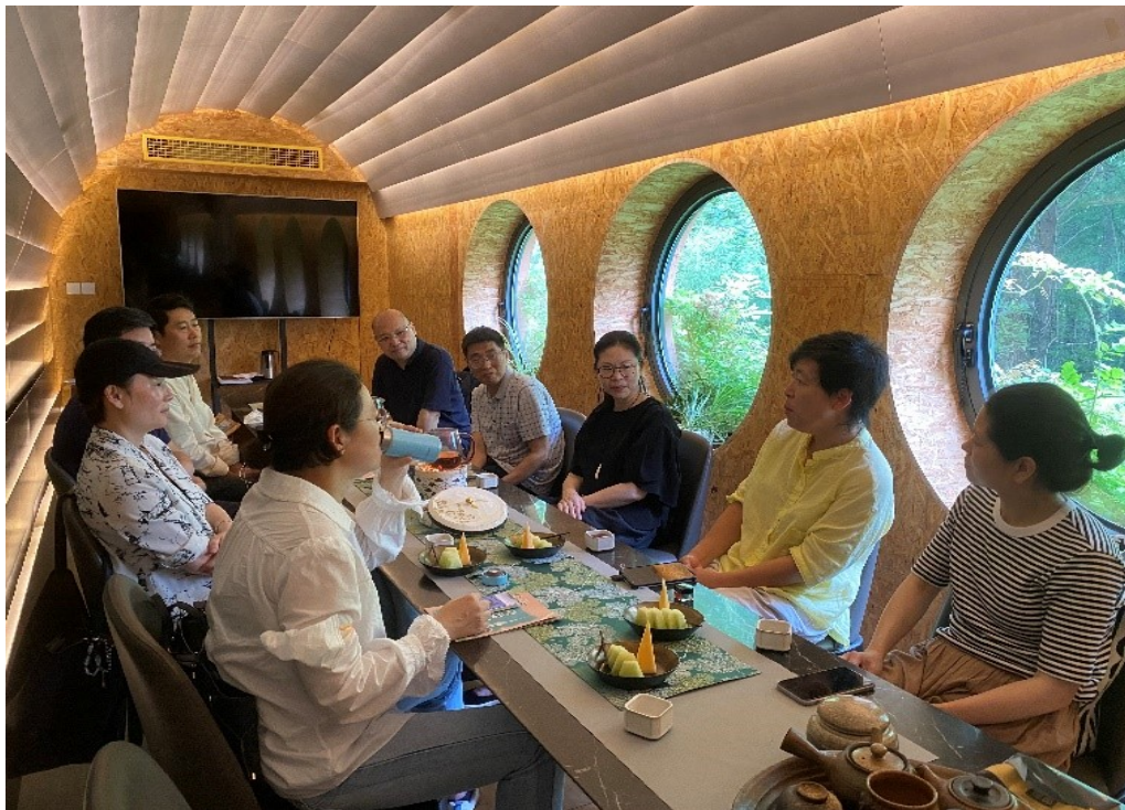
The gathering of HOPE Parents Committee

Parents also toured this award-winning private house where the meeting was held.