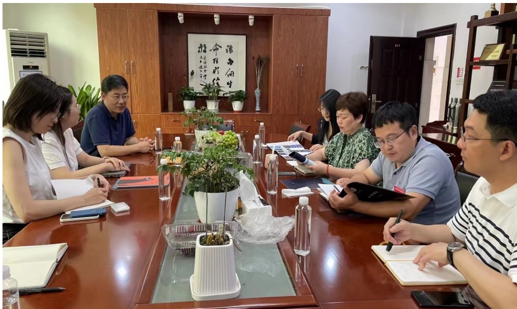
Round-table discussions on partnership cooperations