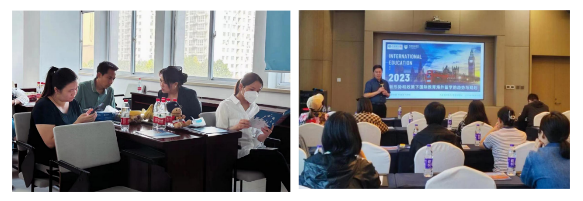
Education workshops and counselling for students and parents

3. HOPE Parents Journal, Parents Trip (e.g. Jingdezhen and Dianshan Lake) and Parents Classroom further activate HOPE Parents Club, and are not only becoming the distinctive features of the Parents Club but also the bridges between HOPE and its overseas returned students parents.