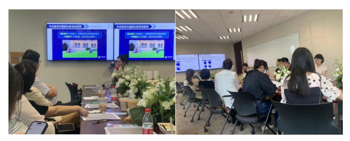
Briefing bank staff on early international education planning

4. HOPE has launched an exclusive strategic cooperation with Industrial Bank carrying out events in over 30 cities in China in 2023 and pushing HOPE business and branding nationwide.