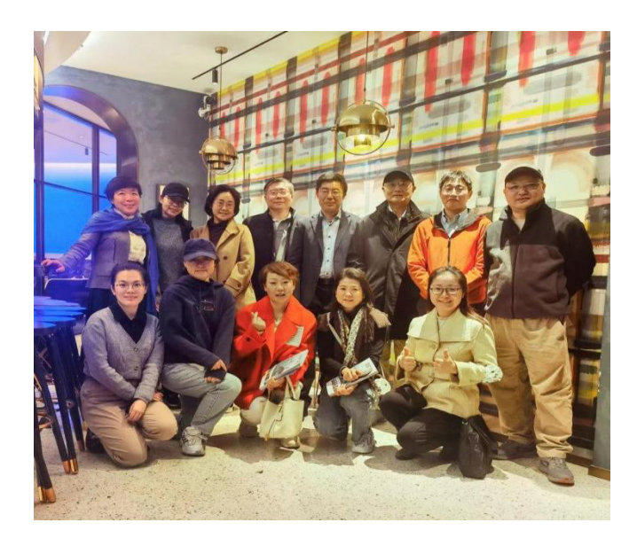
HOPE parents committee meet for new year plan

Two more parents were newly elected as committee members during the meeting. Experienced in foreign affairs and policies, both of them would be able to offer their resource in local government and stated owned enterprises.