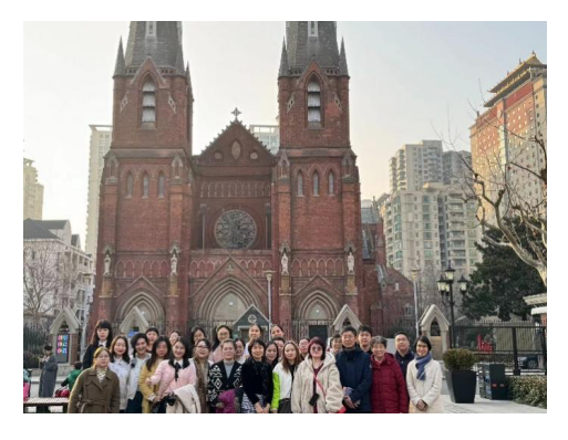
A group photo in front of the famous cathedral

Other than museum, HOPE team also went to see the St. Ignatius Cathedral.