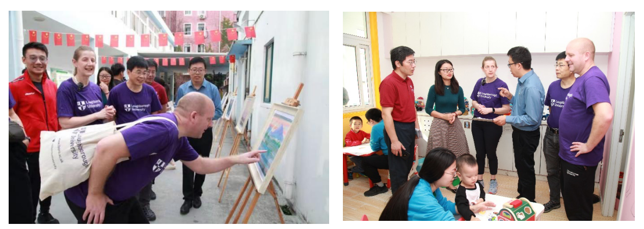
Management team of Loughborough University visiting Clover Autism Rehabilitation Centre arranged by HOPE

7. HOPE established partnership with Royal Holloway University and Reading University for students recruitment; HOPE assisted with Vice chancellor and Pro Vice Chancellor of Loughborough University's visit in Shanghai and the media interviews; HOPE organized the training for university application counsellors from 7 Ningbo International Schools; More partners and more practical events we organized help maintained HOPE's relationships with university partners while opening up more channels for students recruitment.