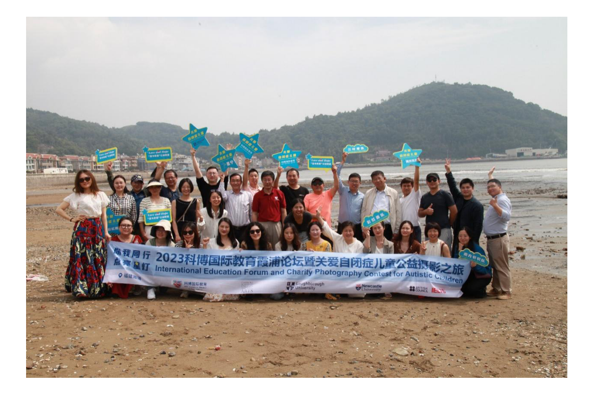
Group photo to mark the start of the charity photography contest during Xiapu Forum

3. HOPE Parents Journal, Parents Trip (e.g. Jingdezhen and Dianshan Lake) and Parents Classroom further activate HOPE Parents Club, and are not only becoming the distinctive features of the Parents Club but also the bridges between HOPE and its overseas returned students parents.