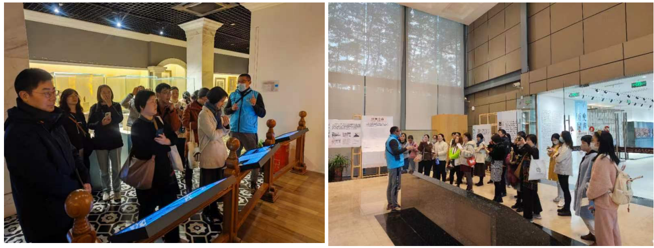
HOPE team visited Tou-Se-We Museum

Xu Jia Hui used to be a centre for foreign culture and exchange. It was named after famous Paul Xu, one of the first persons in modern time China bringing about foreign culture and Christian faith. A museum called Tou-Se-We witnessed progression of Chinese culture absorbing foreign culture.