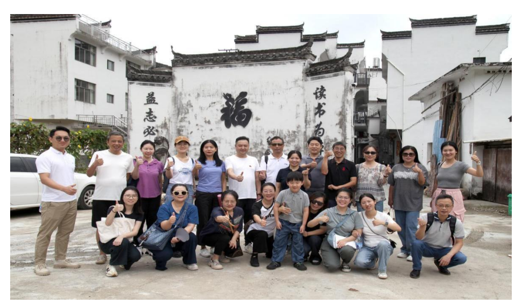
Parents Excursion in Wuyuan, in front of local style houses known as Huiju, a famous architecture style of Anhui Province near Wuyuan

From 20th-22nd September, HOPE International Education organized a 3-day excursion for 20 HOPE students' parents (whose children are currently studying overseas or returned) in Wuyuan county, a perfect place to appreciate the autumn landscape and its architectural culture in south east China's Jiangxi Province. Such type of excursion are organized twice a year all at HOPE's expense and are used as a tie between HOPE and its clients. What makes the excursion unique and unforgettable are HOPE's deep commitments to provide a one-stop service and long term friendship with its clients.