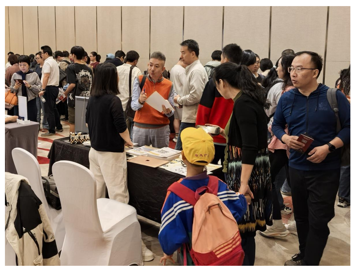
Chinese students and parents participated in an education fair in Beijing on Sept 22.

https://www.chinadaily.com.cn/a/202409/24/WS66f1f850a3103711928a9565.html