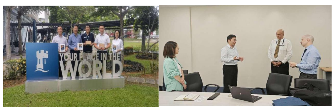
HOPE in Nottingham University Malaysia HOPE visit University of Southampton Malaysia

Marketing Manager, visited Malaysia and Singapore. Given the fact that more and more enquiries have been received from students on studying and camping in south east Asian countries, working with partner schools and universities, particularly UK institutions Singapore and Malaysian campus become one of HOPE's priority for new product development.