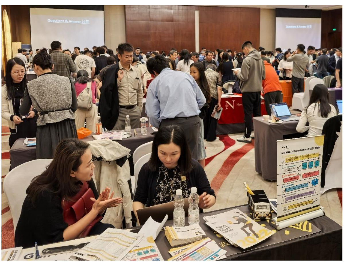
Chinese students and parents participated in an education fair in Beijing on Sept 22.

"What I can say is the vast majority of Chinese students going to the USend up studying in the US, and we really welcome them to continue to do so," she added.