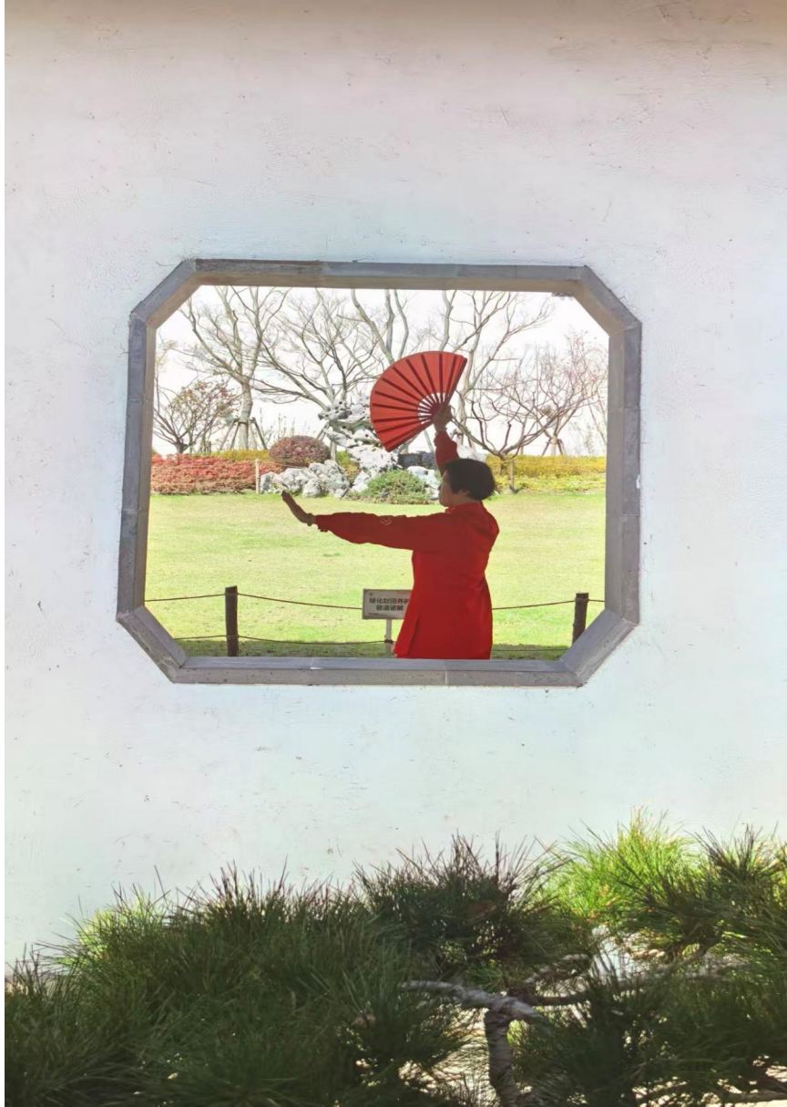
Spring in Shanghai at Westbank Arts Park