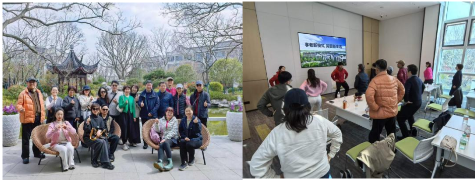
Hope organizing Taikang Wu Garden, Suzhou visit

a presentation on the UK tour to AUB this summer in Wu Garden, introducing in detail the AUB study tour routes customized specifically for the 50+ group to the elders on site.